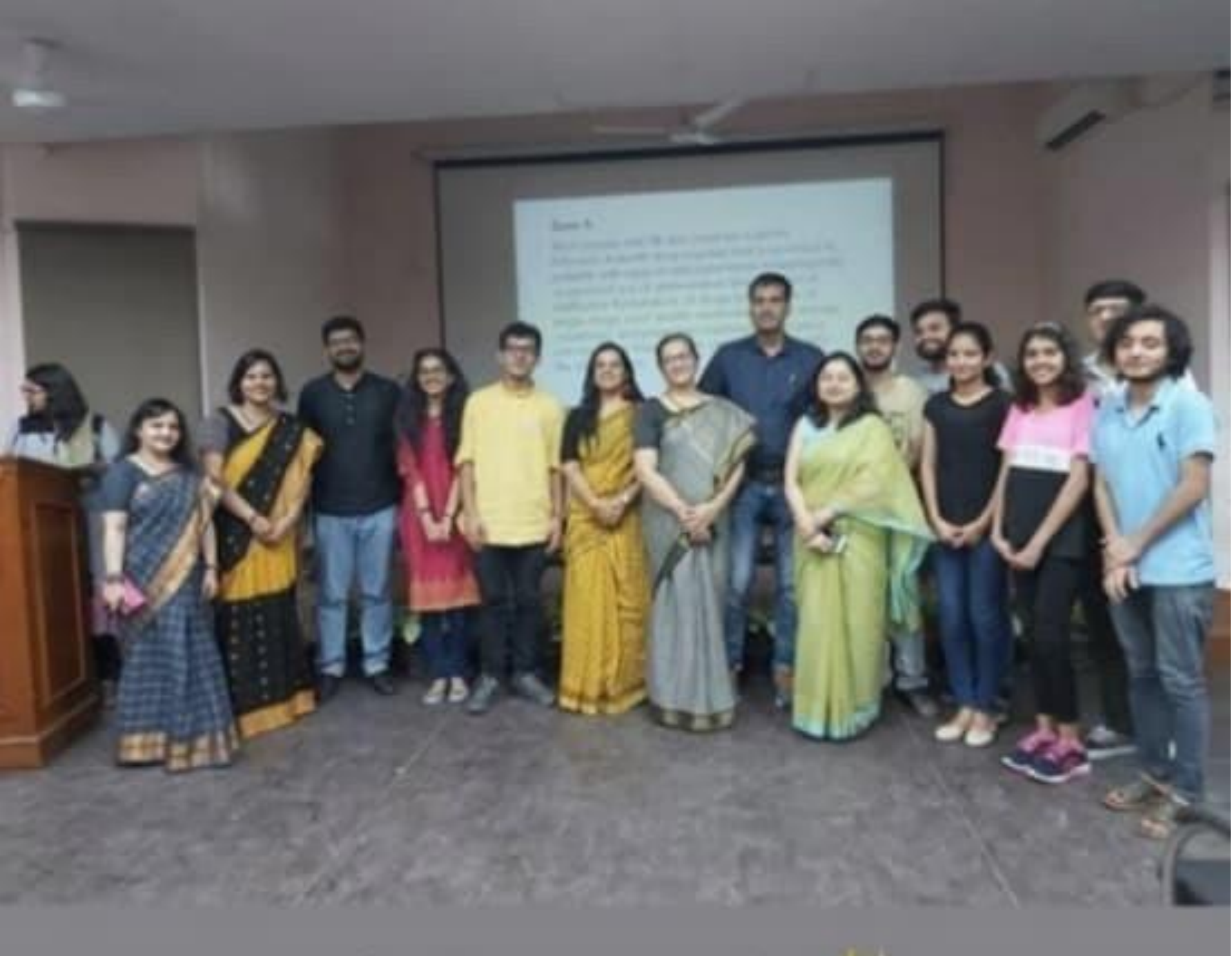
Quiz result *